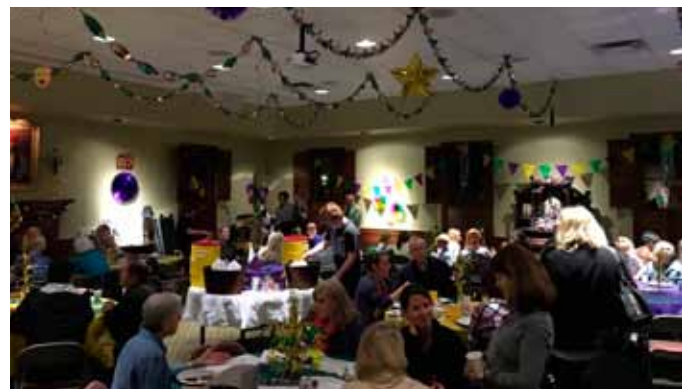
Amazing turnout and support for the youth group!