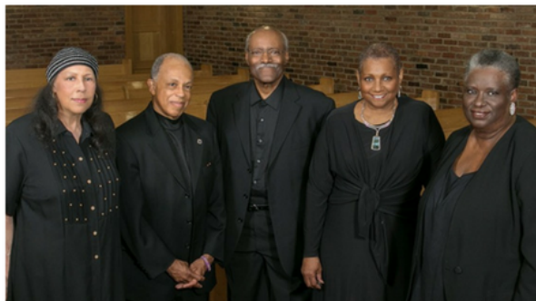
"Just Us", Fisk Jubilee Singers Alumni, Music

The Dedication of a Permanent Historic Marker with the names of lynching victims directly follows the service at nearby St. Anselm's Episcopal Church.