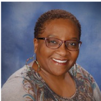
Naomi Tutu, Preaching