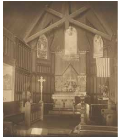
St. Paul's Altar Circa 1927